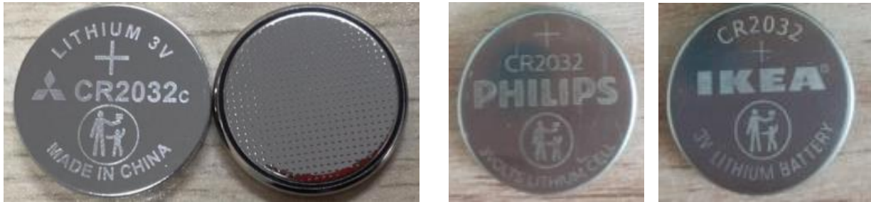
Cell/电芯 (CR2032 3,0V 210mAh)