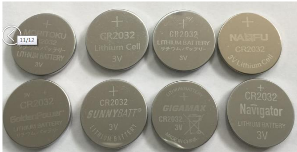
Cell/电芯 (CR2032 3,0V 210mAh)