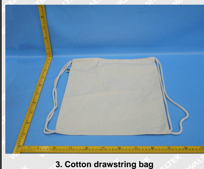
3. Cotton drawstring bag