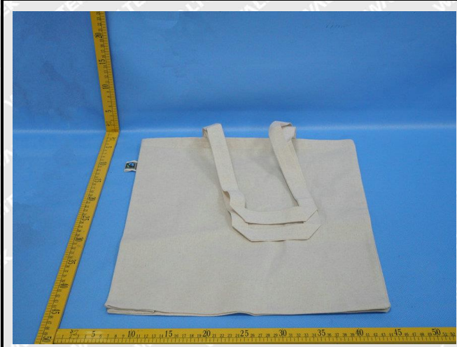
1. Cotton shopping bag