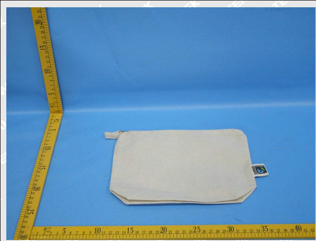
2. Cotton cosmetic bag