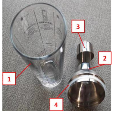
1, 2, 3, 4: direct food contact