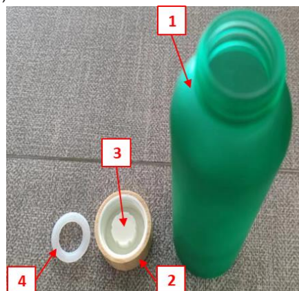
1, 3, 4: direct food contact

The following substances subject to restrictions and/or specification are used in the above-mentioned product. The materials and raw materials used comply with Regulation (EU) No 10/2011.