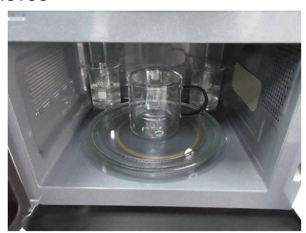
1#-1 During Test