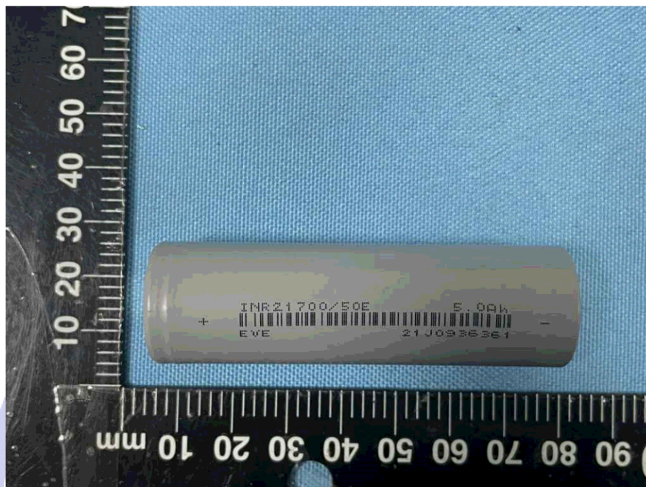
Photo 1 Front 正面