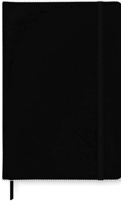
2. FRONT PD