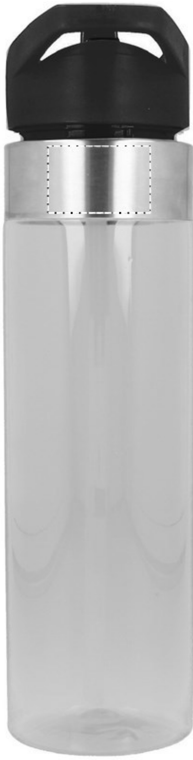
5. BACK RING