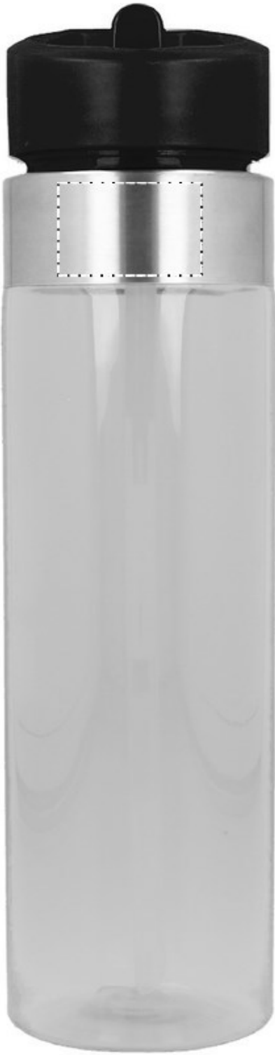
4. FRONT RING