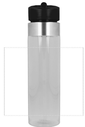
3. ROUND PRINT