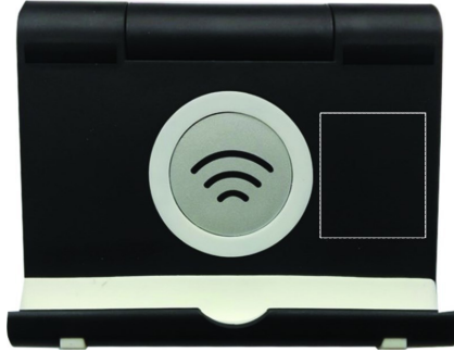
2. FRONT RIGHT