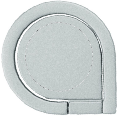
1. TOP LY