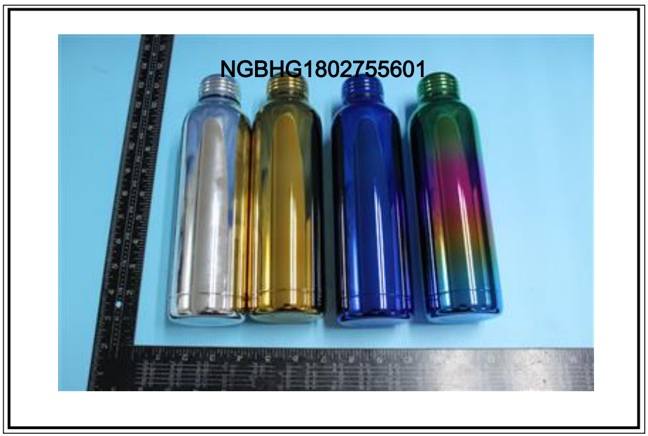
SGS authenticate the photo on original report only